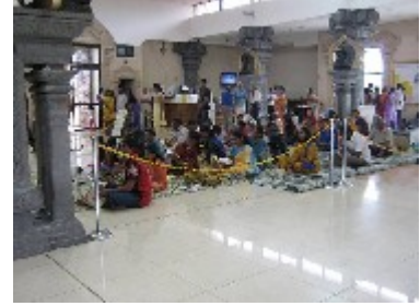
ThaiPongal at Sydney Murugan