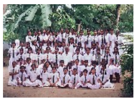
Mangayarasiyar Mahalir Illam Batticaloa