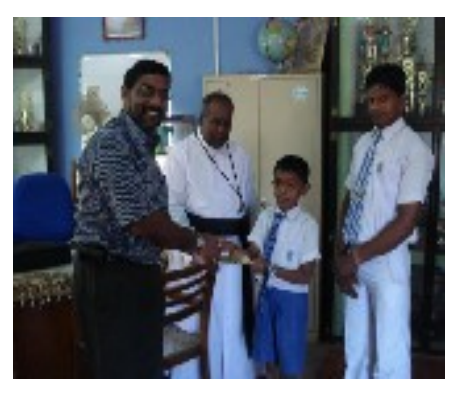
St Josephs College