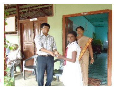
Manipay Ladies College